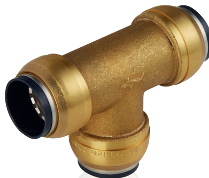
SharkBite 10mm - 28mm

Rigorous manufacturing and quality control, as well as long-term internal product testing, ensure the durability and seamless performance of the SharkBite Air & Pneumatics fittings.