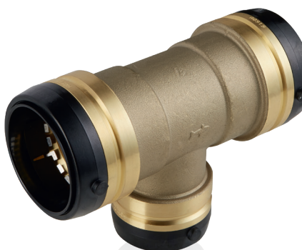
SharkBite 35mm - 54mm